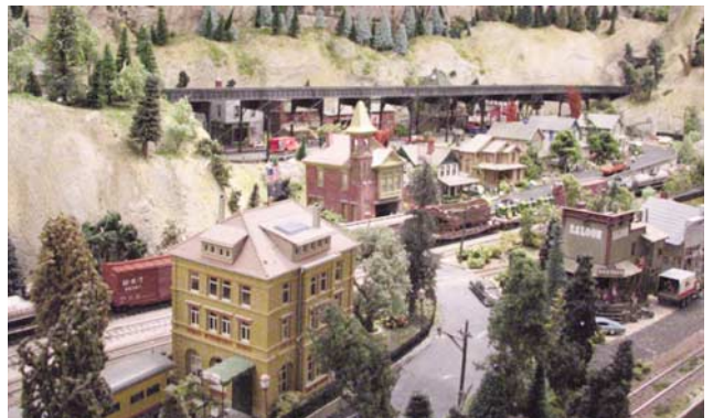
Bill Brigg's 30 x 50 HO layout was featured in the Fall 2007 tour.