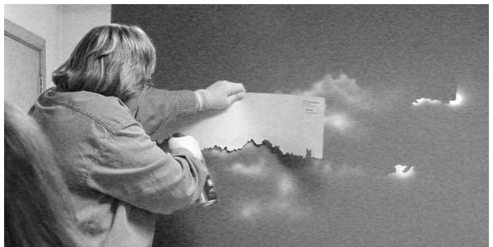
Gloria Burnell demonstrates the use of a stencil during her backdrop cloud painting clinic at a previous TCDivision meeting.

The evening usually wraps up with a drawing for half-a-dozen or more door prizes, generously donated by local hobby shops.