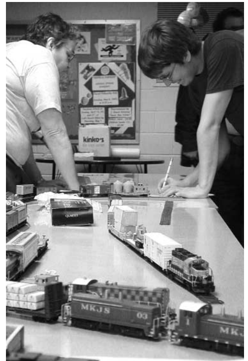
Monthly Popular Vote Contests, each with a different theme, give members the opportunity to both show their work and win prize ribbons.

Other fun reasons to come. Each meeting features a Popular Vote Contest for models, based on a pre-announced theme. Themes have ranged from grain elevator dioramas to maintenance-of-way cars to whimsical railroads. Ribbons are awarded for first, second, and third place winners as selected by the meeting attendees. In addition, NMRA Merit Award judging takes place at one meeting every year. Members participating in the NMRA's "Master Model Railroader" Achievement Program—and other modelers curi-